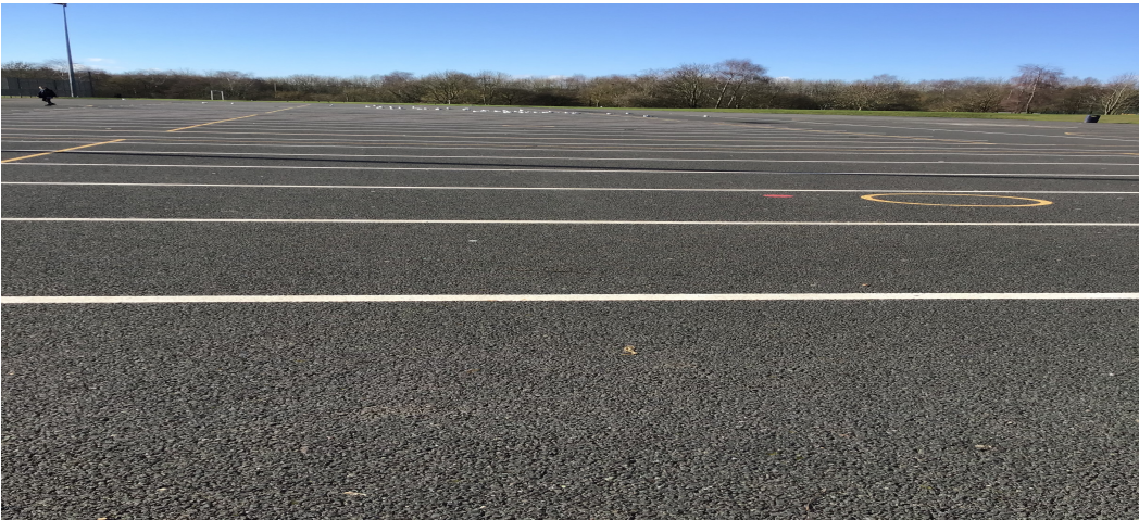
This is the Old All Weather Pitch

In Year 7, you share break and lunch times with Year 8 and Year 9.